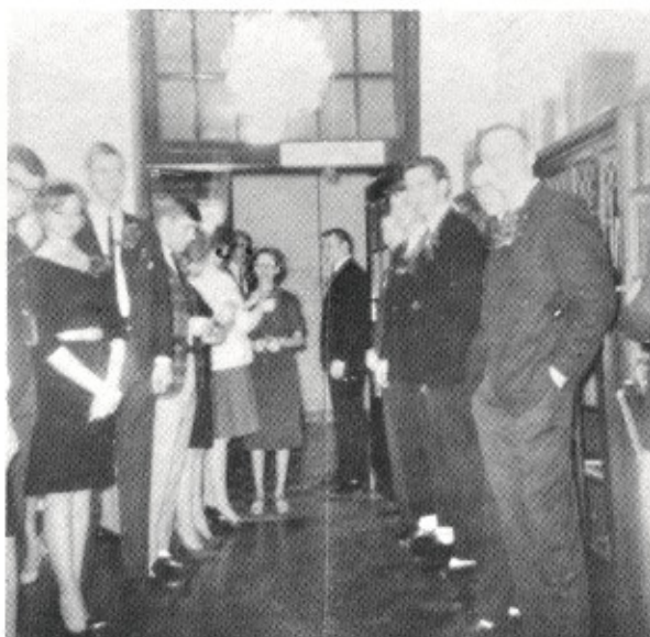
D.E. Reception Line